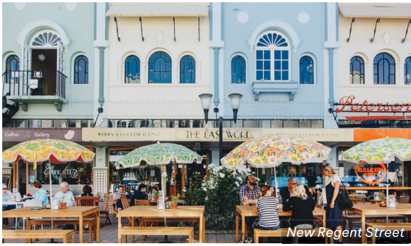
New Regent Street

Savour your morning coffee at relaxed cafés, stop for a refreshing beer at friendly bars, discover wholesome farmers' markets, or treat your loved one to romantic fine dining at award-winning restaurants. Our culturally diverse region has something to satisfy all tastes and budgets.