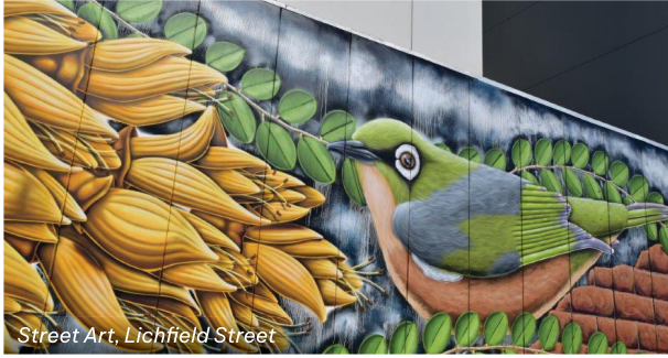
Street Art, Lichfield Street

Spend your days wandering the street art filled laneways, discovering creative murals that decorate our buildings. There is no need to rush, in Christchurch we make time and space for quiet moments of wonder.