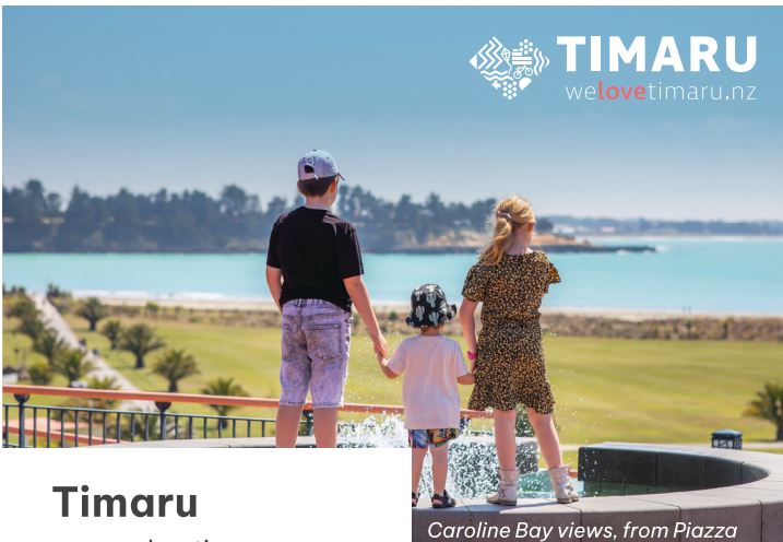
Caroline Bay views, from Piazza