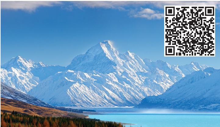
Aoraki Mount Cook