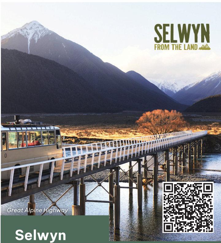
Great Alpine Highway

If shopping is your thing, browse the boutique shops dotted throughout the central city laneways alongside well-known brands, or enjoy the convenience of our shopping malls around the wider Christchurch area.