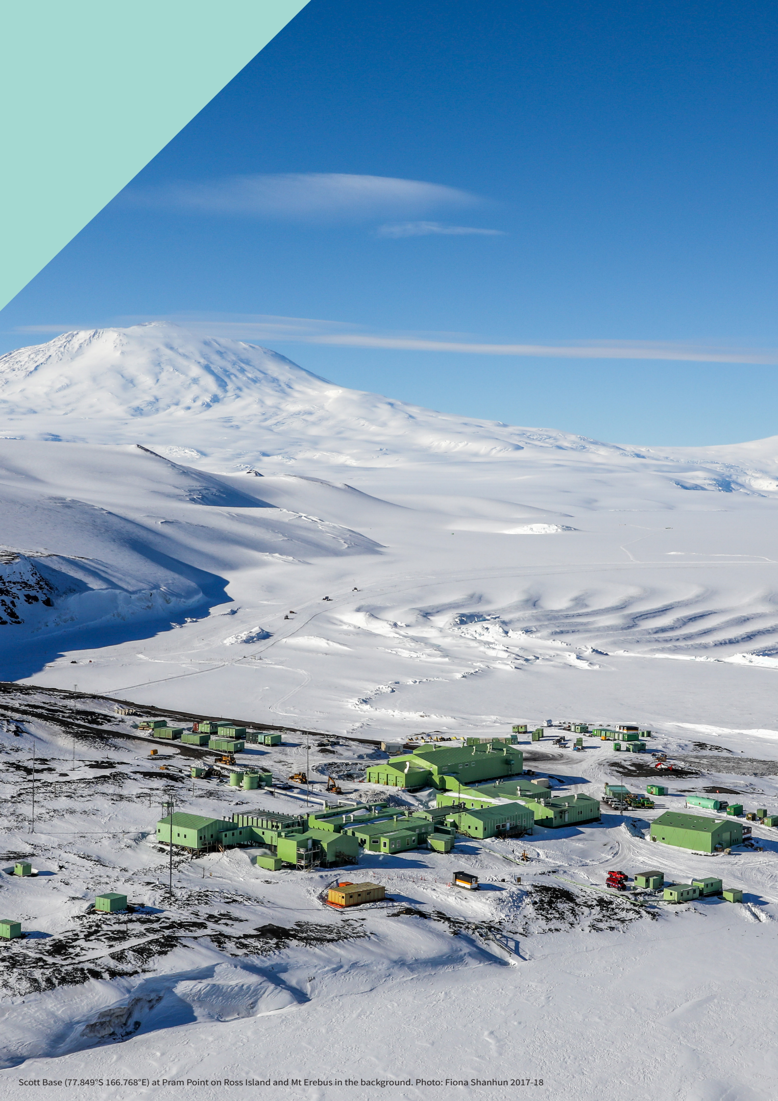
Scott Base (77.849°S 166.768°E) at Pram Point on Ross Island and Mt Erebus in the background.