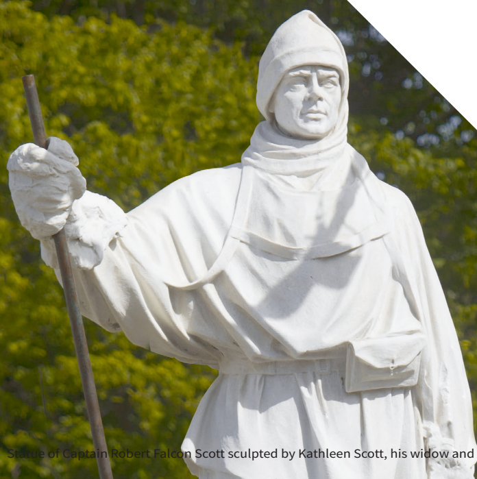
Statue of Captain Robert Falcon Scott sculpted by Kathleen Scott, his widow and unveiled in 1917

The recent COMNAP Antarctic Roadmap Challenges (ARC) project identified opportunities to link New Zealand’s innovation sector to support the more efficient and effective delivery of Antarctic science. This link, in turn, creates opportunities to translate the technology-based science support in remote sensors, power generation and satellites into potential commercial opportunities elsewhere creating further positive outcomes for Christchurch and New Zealand.