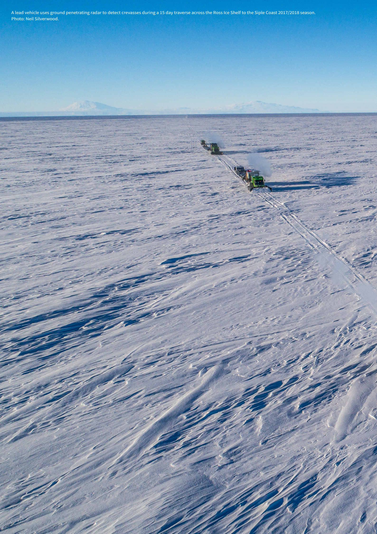
A lead vehicle uses ground penetrating radar to detect crevasses during a 15 day traverse across the Ross Ice Shelf to the Siple Coast 2017/2018 season.