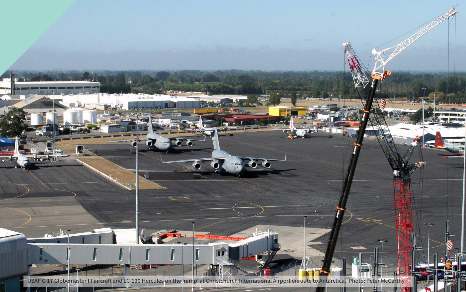
USAF C-17 Globemaster III aircraft and LC-130 Hercules on the 'ramp' at Christchurch International Airport enroute to Antarctica.

Our vision is for Christchurch to be an Antarctic city where we celebrate and realise the value of our gateway status for the benefit of the city and the nation, for current and future generations.