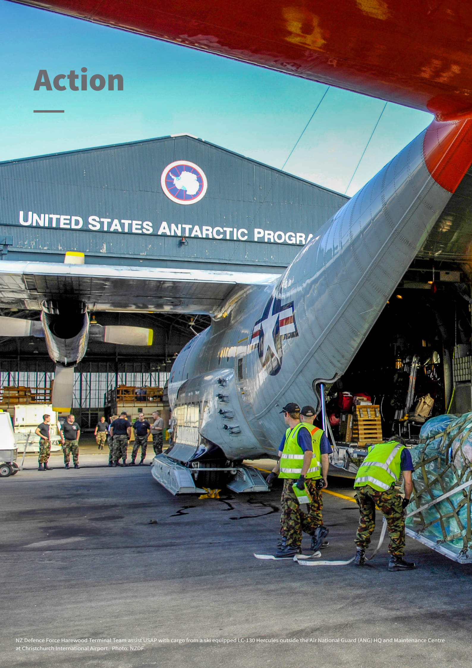
NZ Defence Force Harewood Terminal Team assist USAP with cargo from a ski equipped LC-130 Hercules outside the Air National Guard (ANG) HQ and Maintenance Centre at Christchurch International Airport.